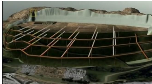
Fig.3.laying of pipes in layer in four stage system

The gas are generated during the decomposition of the garbage cannot be left out consideration. This gas harmful to the atmosphere and nearby resident. This gas are collected by providing the pipes between the garbage layers in four stage system.