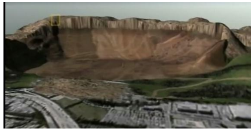
Fig.2.formation of base

In formation garbage mountain followings steps involved: