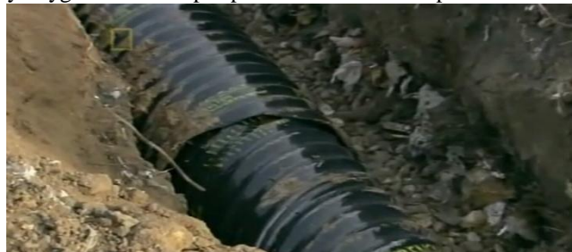
Fig.4.laying of pipes in layer in male female system

To collect and convey the gases generated during decomposition of the waste. To provide a means to supply oxygen to the deeper part where the decomposition is slow due to lack of it.